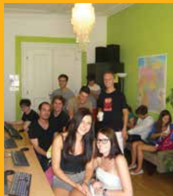
Internet terminals in Munich

Our fully equipped kitchen is a popular hang-out during the breaks and enables an intensive exchange between students and teachers beyond lesson time. Here, extra-curricular activities for the evenings and weekends are planned and these often form the beginning of lasting friendships.