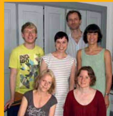
Some of our teachers in Berlin

You will note that our instructors can be seen as highly motivated, very competent and knowledgeable friends who are teaching the class. As a result, the members of our staff are not only available to discuss matters of German language but are also happy to help you with advice on other subjects of life.