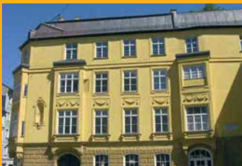
Our school building in Munich

Both of our schools are in the very centre of the two most attractive German cities: Munich and Berlin. Thanks to our highly qualified teachers, the welcoming atmosphere and the modern teaching facilities, we have earned a very good international reputation. Our classrooms are equipped with the latest technology to support the students' learning process.