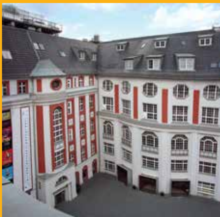
Our school building in Berlin

Our fully equipped kitchen is a popular hang-out during the breaks and enables an intensive exchange between students and teachers beyond lesson time. Here, extra-curricular activities for the evenings and weekends are planned and these often form the beginning of lasting friendships.