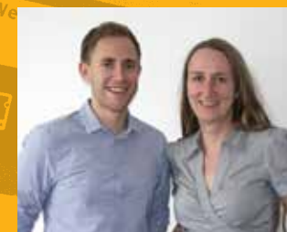
Our office team in Berlin

You will be in contact with our office team from the beginning of your first enquiry, up to your booking arrangements until your first day at school. They will be the ones to welcome you and assist you in any matter related to your stay in Germany until it is time to say goodbye on your last day of school when they hand out your language certificate to you.