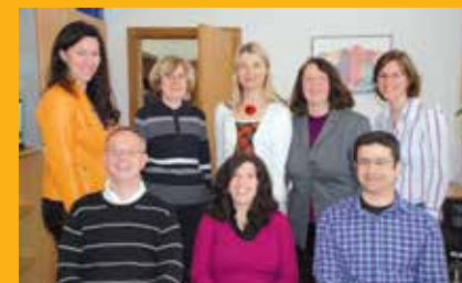
Some of our teachers in Munich

We believe that excellent teaching is the most essential asset to a successful school. Due to continuous further training, our qualified and experienced teachers are well acquainted with the latest developments in the area of German as a foreign language.