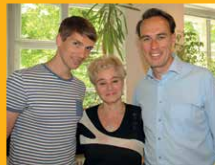
Our office team in Munich

In our offices we do not only speak German but also English, French, Spanish, Italian, Portuguese and Russian - just in case there is something you would prefer to discuss in a language more familiar to you.